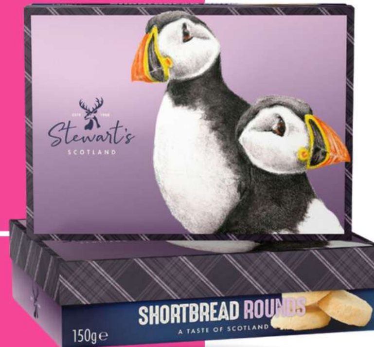
POSY & PIPPA