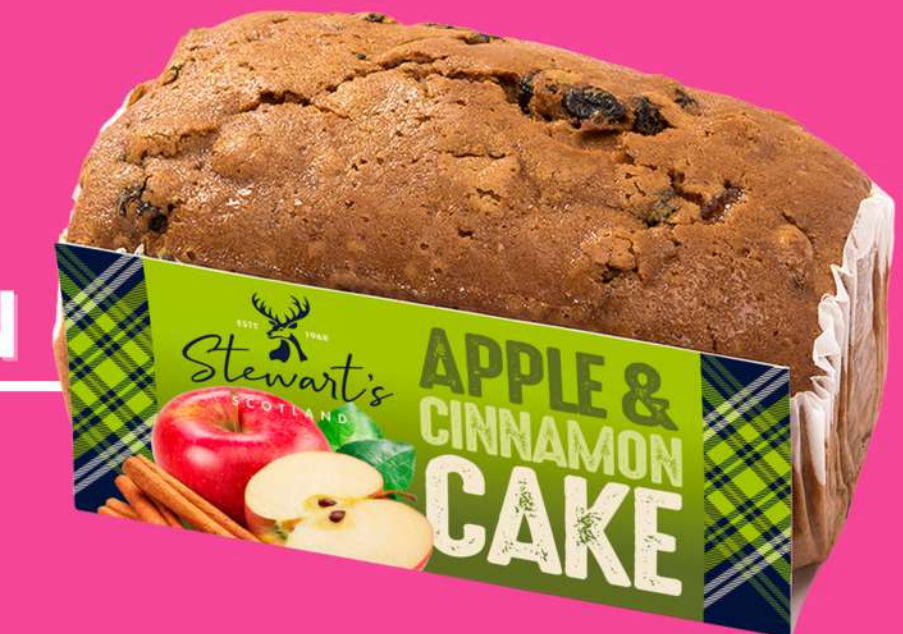
APPLE & CINNAMON