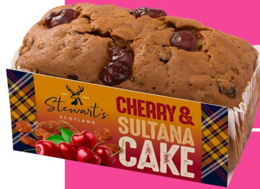
CHERRY & SULTANA