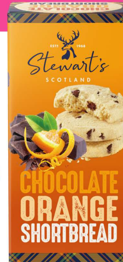
Chocolate Orange Shortbread