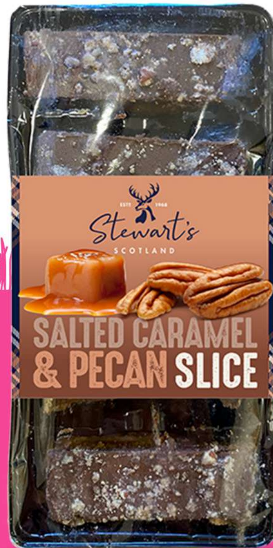
Salted Caramel & Pecan