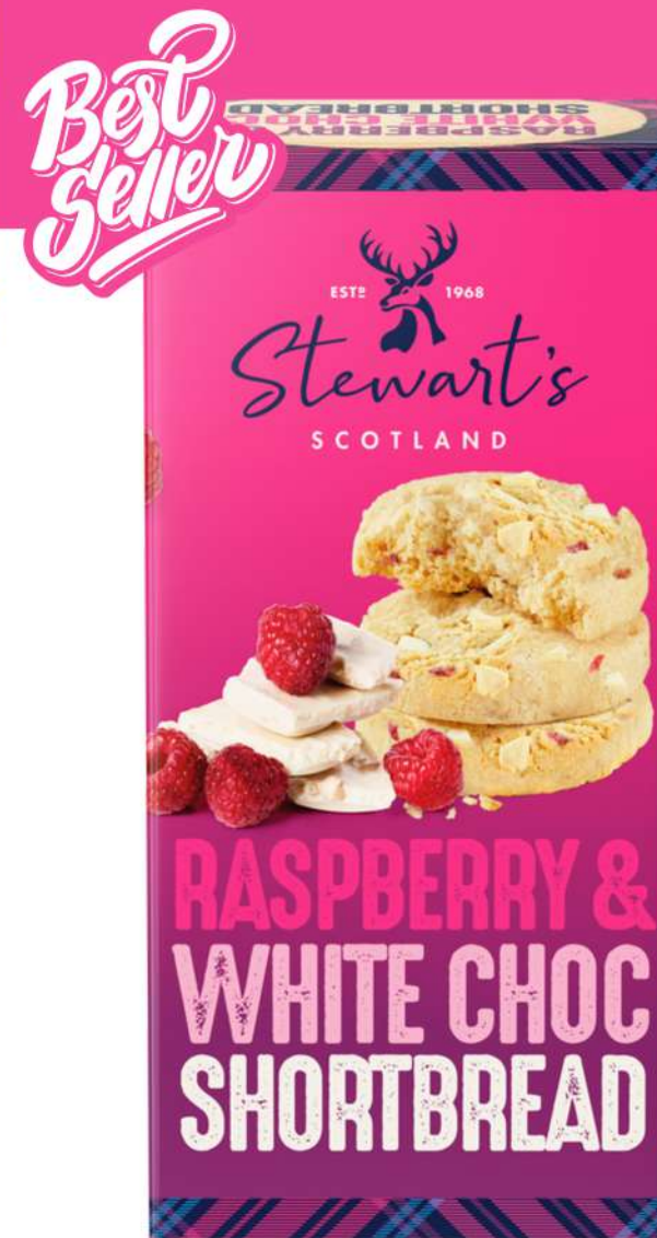
Raspberry & White Chocolate Shortbread