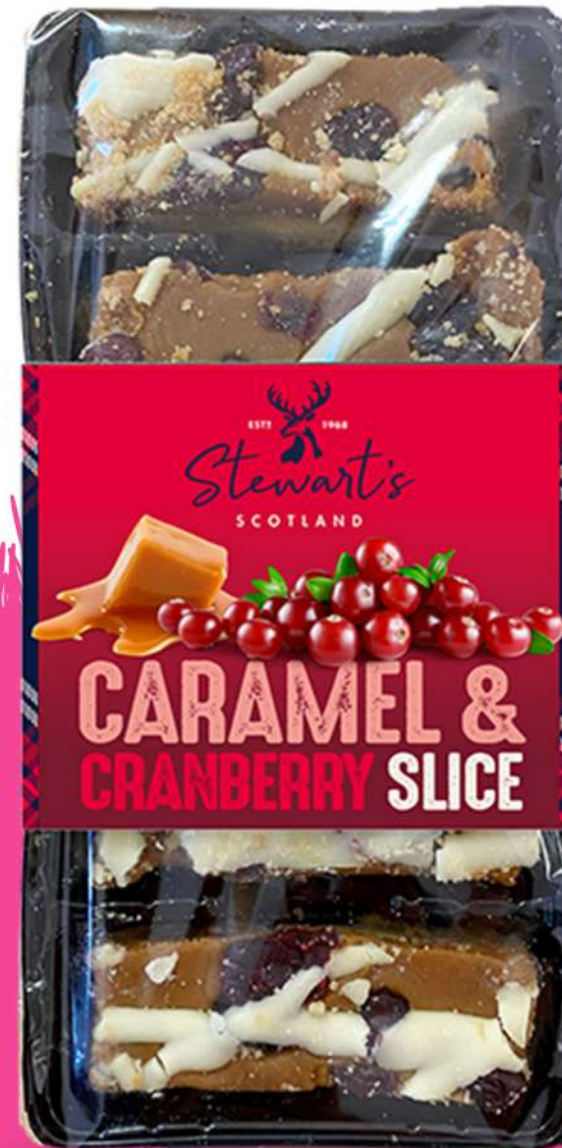
Caramel & Cranberry