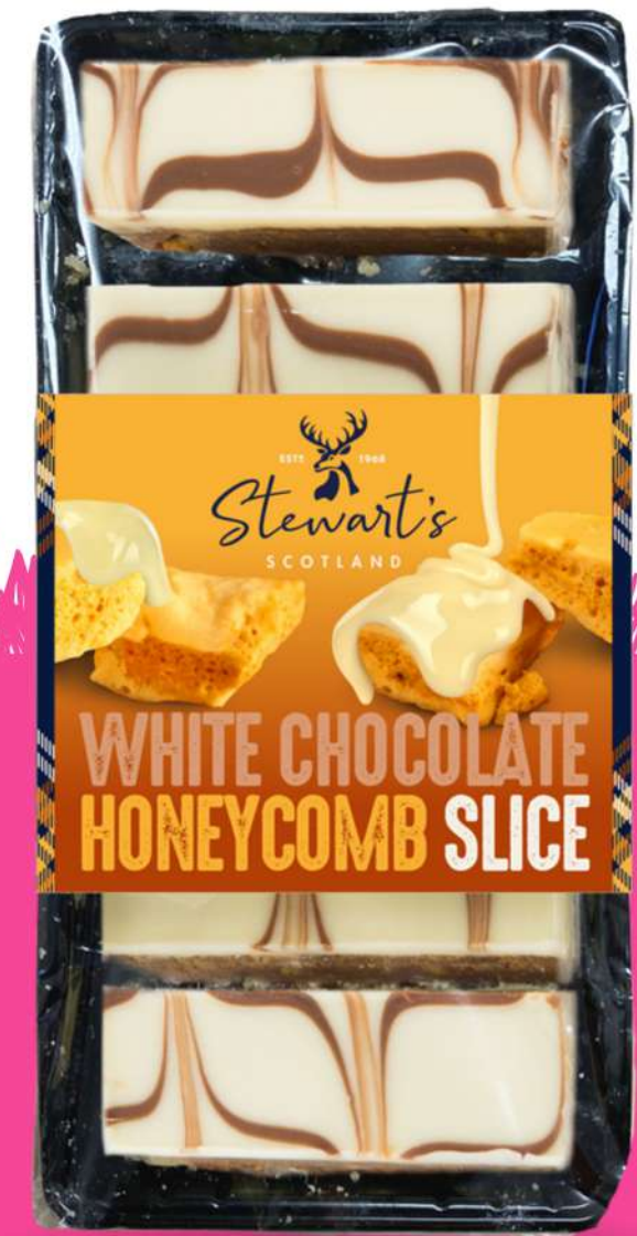
White Chocolate & Honeycomb